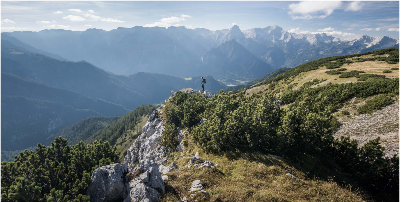
Hiking in the Pyhrn-Priel holiday region in Upper Austria