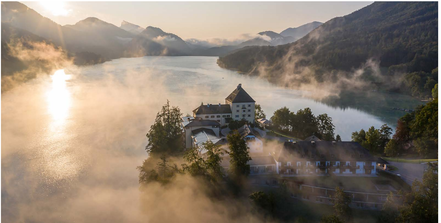
Drone view - Fuschl Castle