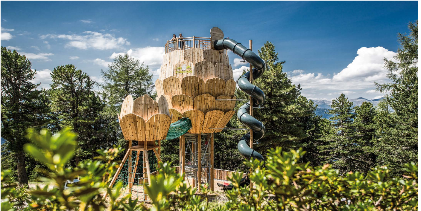
Stone pine park on the Hochzeiger summit in Pitztal