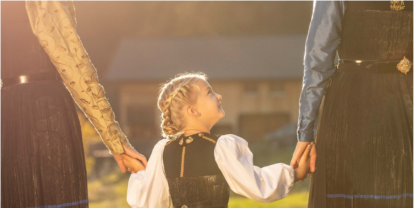
Girl in a traditional costume Bregenzervald Vorarlberg